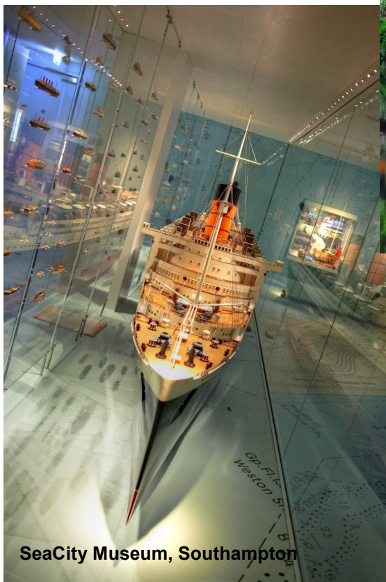
SeaCity Museum, Southampton