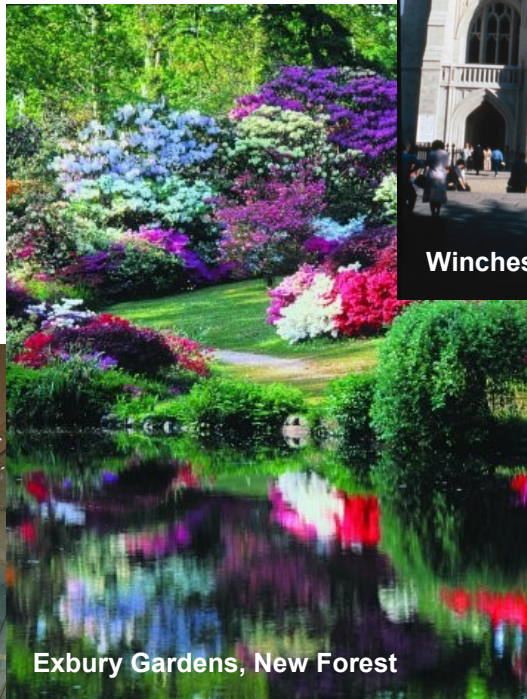
Exbury Gardens, New Forest